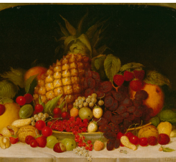
1 Walled Lake Market Place & Event Field 1499 E West Maple Rd Fruit Piece , Robert S. Duncanson