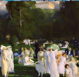
4 Hiram Sims Memorial Park A Day in June , George Wesley Bellows