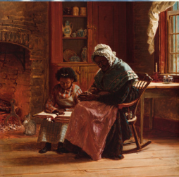
6 Walled Lake City Library 1499 E West Maple Rd Suite 100, Main Entrance Sunday Morning , Thomas Waterman Wood