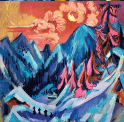
3 Walled Lake - Michigan Air Line Trailhead Parking Lot 840 N Pontiac Trail Winter Landscape in Moonlight Ernest Ludwig Kirchner