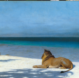
5 Mercer Beach of Walled Lake Solitude , Jean-Leon Gerome